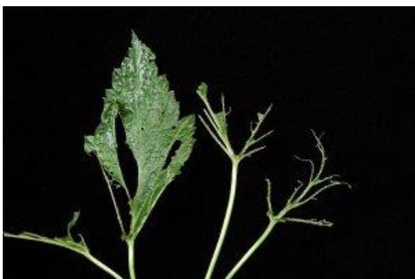
Figure 1. Blackcurrant sawfly damage on a blackcurrant bush

Blackcurrant sawfly is a common and frequently damaging pest of blackcurrant, present to varying degrees in all UK blackcurrant plantations. After overwintering, adults will emerge in late April or May. They are most active on warm sunny days laying their eggs on the underside of the blackcurrant plants leaves. Feeding at the base of the bushes, during May and June, hatched larvae (1st generation) develop through four or five larval instars (Mitchell et al., 2011). After spinning a cocoon, the pre-pupal stage falls to the ground and pupates in the soil. In July- August, second generation adults emerge. Developing larvae make irregular holes in leaves (Figure 1), causing defoliation which weakens the bushes and causes substantial losses in yield (Mitchell et al., 2011). Larvae may also contaminate harvested fruit so good control prior to harvest is important.